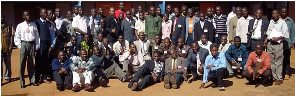
The conference group at Chipata, Zambia

Please pray that these pastors will be strengthened in their lives and ministries. Pray also for the local leaders who assisted in the teaching, in particular about the possibility of the local men arranging teaching conferences in Chipata now that the PTI series has finished.