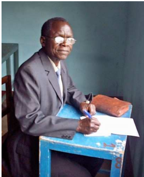
One of the pastors at Solwezi