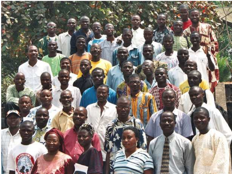
The Kenema conference group